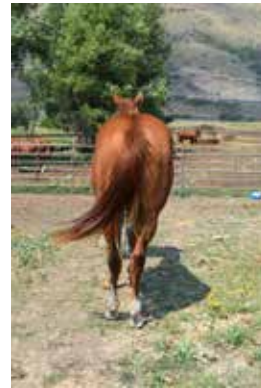
HILLS RED SOLO DASH , 5-31-2013 sorrel gelding, by Hills Dash To Vegas out of Pande Tootn N Vegas, by Vegas The Third (Vegas Hard Way AAAT) and a Pandemar by Pana Bar 100si bred dam. He is so gentle, will be a great head horse, barrel horse or just about anything you want to do with him.