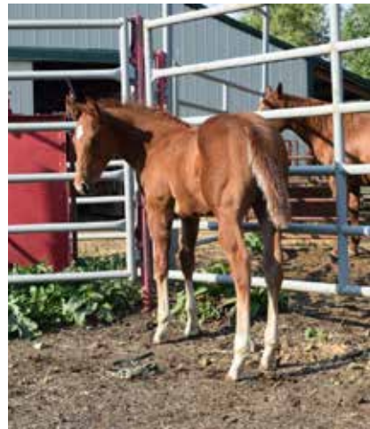
5-30-2015 sorrel colt by Hills DashTo Vegas out of Pandes Vegas Alumni. Alumni is by Pandemar (by Pana Bar 100si) with Black Deck on her sire's bottom side. Then her dam is Classic Hardway which is by Vegas Hard Way AAAT with Classy Bar on her dam's bottom side. WOW, can't ask for better blood lines to do what ever you want, run barrels or chase cows.