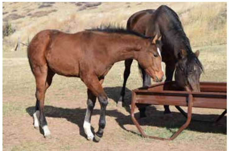
6-14-2015 bay colt by Hills Dash To Vegas and out of Hills Cash Crop, she is by Cash In Your Bux and out of Acute, can't ask for a more proved barrel race line than that. They have even been known to be rope and dogging horses! This boy will have the speed and disposition to do it all. He will be called Hills Finish Line Dash, as he may be the last foal I raise.