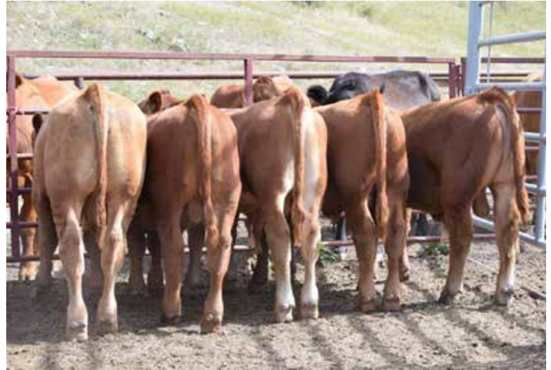
Get of Sire Performance Class Champions at the NILE 2015 Bull Butts