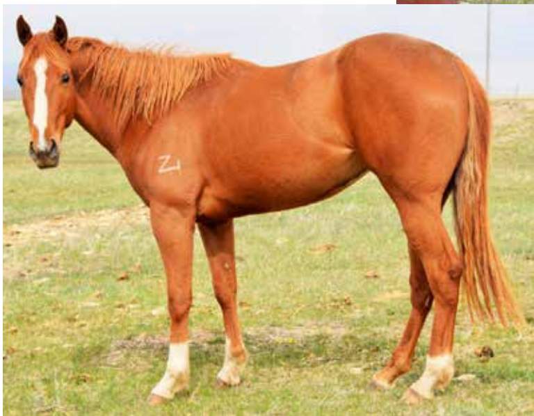
HILLS DASHES CUTIE 6-29-2012 sorrel filly is by Hills DashTo Vegas and out of Hills Cash Crop by Cash In Your Bux and out of Acute (she was an awesome brood mare, then all her off spring did the same) Goes back to Givemalickin 100si twice and Vegas Hard Way AAAT twice then add Bar Jay Bee too. She is royally bred, and sells as a brood mare only because she injured a hind leg as a baby. She is very gentle and comes up to you out in the pasture.