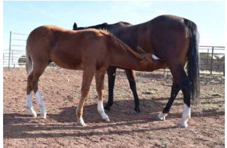
4-28-2015 stallion by Hills Dash To Vegas (Givemalickin) out of Ms Pande Cash (Cash In Your Bux and out of a Pandemar mare) with smart speed & cow on both sides, he should be able to do anything you want and have fun doing it.