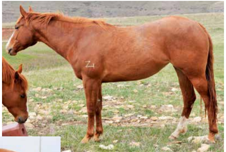
MHILL PANDE DASH 5-01-2012 sorrel filly by Hills Dash To Vegas out of Pande Tootn N Vegas by Vegas The Third--goes back to Vegas Hard Way and Pandemar by Pana Bar 100si, with the dams bottom side to Pandemar again and Toots South. If you want a big mare that is extremely gentle and willing to please, pick this one!